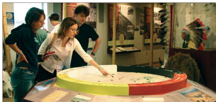
Park visitors looking at an interpretive site map at the White River Visitor Center.

Le opaspe ki woyuha hena takuni iwoto kte sni na wowakan he patan kte. wowakan wicochan ecela na opapi hena oiyaye patagyakel iyowincakiyapi kte. Wayuiyeskapi hena tilehang omanipi tipi hel ecunpi kte. Opaspe ki lel tilehang omani ki wowahwa na wiyukcankancel woikiksape yuhapi kte, canke manian ecela oiyaye yuhapi. Le opaspe ki el wawicahyapi wanicin kte.