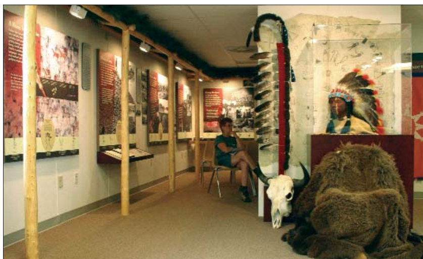
Exhibits on display at the White River Visitor Center.

This zone is managed to prevent resource impacts and maintain sacred feeling. Access may be limited to accommodate ceremonies that may be open only to participants. Interpretation would occur at the visitor contact station. Visitors would have quiet, reflective experiences in this zone, which is accessible only by foot. No development is permitted in this zone.